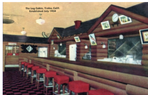
The interior of the Log Cabin Bar & Restaurant as in 1934