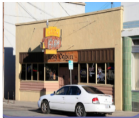
The Log Cabin at 118 S. Broadway, Yreka. Photo taken in about 2013